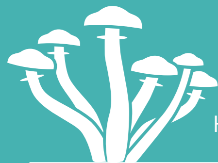
Harore Honey mushroom