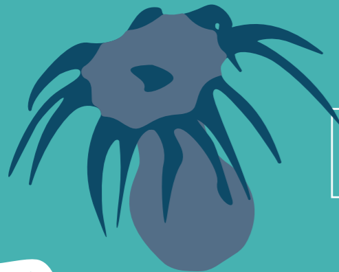
Puapuatai Flower fungus