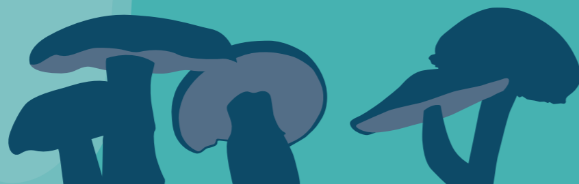
Harori-kai-pakeha Field mushroom