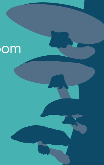
Tawaka Poplar mushroom

Sadly, some fungi have lost their place to live or have been affected by other changes and are now rare. Protection of Tāne-mahuta is important for all his descendants - the fungi, animals, and plants.