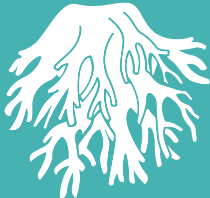
Pekepekekiore Icicle fungus

Our great forests of Tāne-mahuta hold a treasure trove of fungi (hekaheka), many only found in Aotearoa. Certain kinds of fungi were traditionally valued by Māori, like āwheto (vegetable caterpillar) which was burned and used to make ink for tā moko / tattooing.